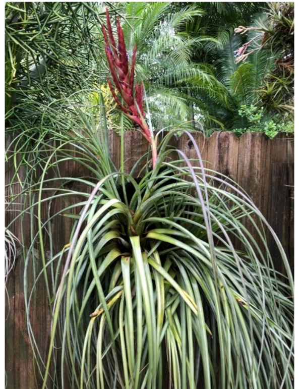
April 2021 T. fasciculata hybrid 3