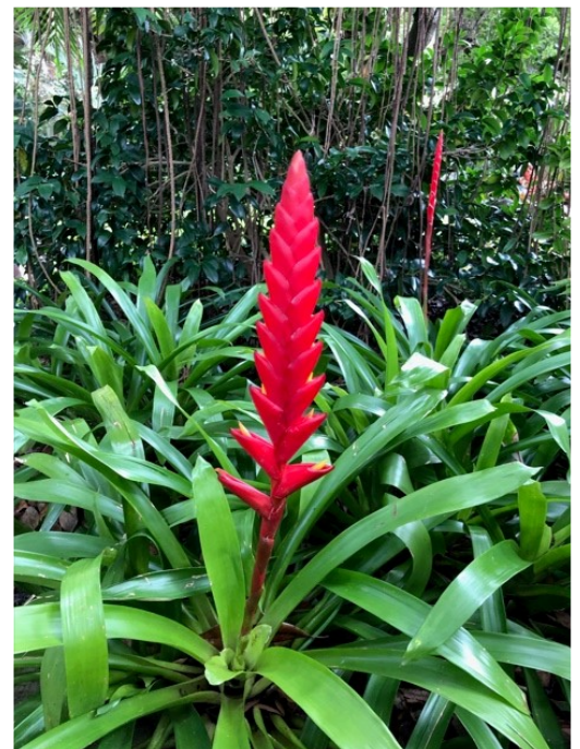
June 2021 Vriesea ensiformis