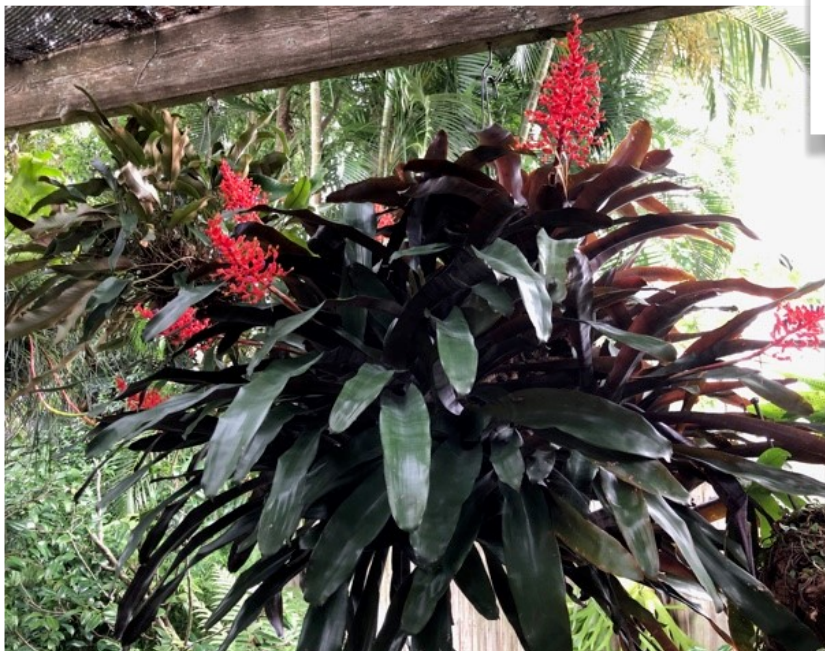
Aechmea 'Maginali' June 2021.

The uncredited photos here come from the BSCF Facebook Group. Please check us out! https://www.facebook.com/groups/ 263882333744906