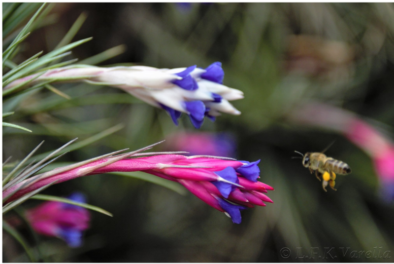
Tillandsia aeranthos varieties