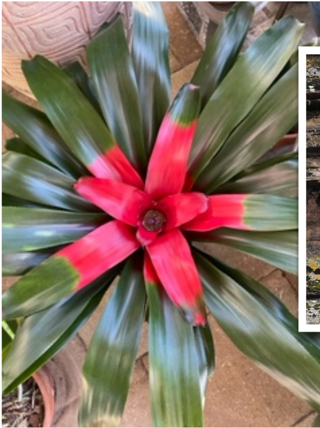
Neoregelia 'Victoria Red'

I would love to have members submit pictures and articles that can be published in our newsletter. It's not that hard to do and can even be a picture or article from another source as long as you reference it.