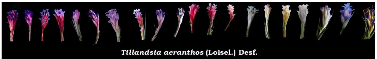
Tillandsia aeranthos (Loisel.) Desf.