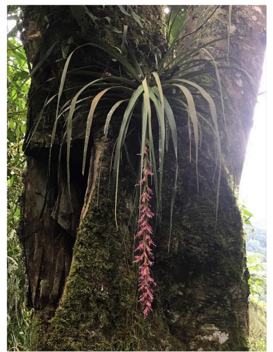
Hanging Gardens Tillandsia engleriana Central Andes Columbia

The uncredited photos here come from the BSCF Facebook Group. Please check us out! https://www.facebook.com/groups/ 263882333744906