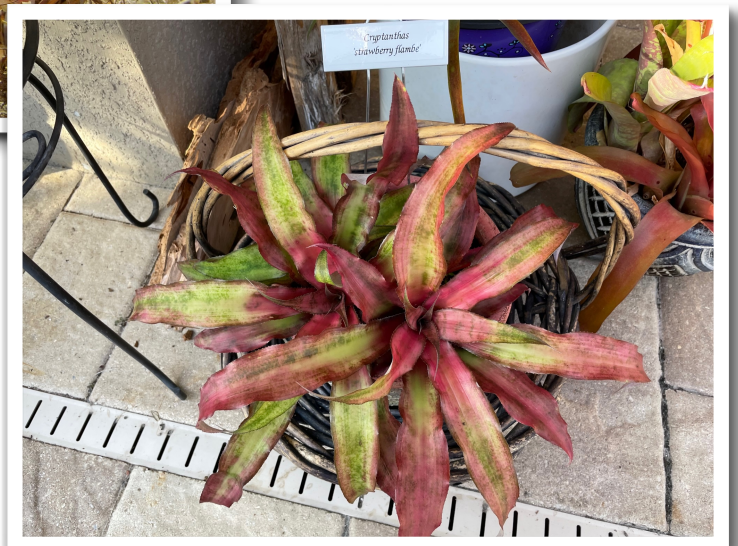
Cryptanthus 'Strawberry Flambe': Telka diFate