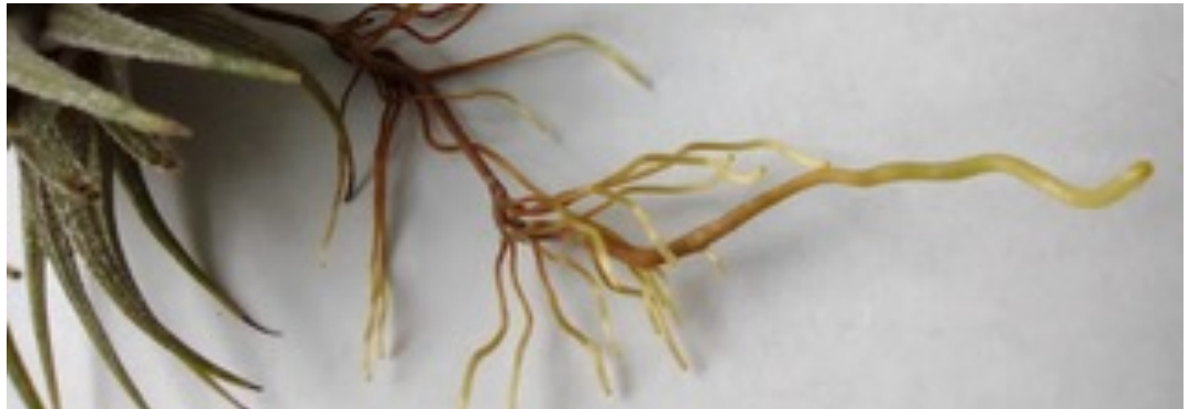
Mature Tillandsia roots reaching out for a place to attach

It also has been observed that seedling Tillandsias sprouting on the bottom or side of a branch are often more numerous and stronger than those that had the luck to land on the top of the branch. Is this because of those initial upward growing roots not attaching? Maybe that is a factor. However, it has also been observed that In Nature the seeds on the top of a branch can get exposed to too much sun when they are young and dry up before they get established. The ones on the bottom and sides have more protection. Attaching to the side or bottom of a branch can increase the likelihood of survival to adulthood. Over time, and as generations pass, the clump may end up on top of the branch or may encircle it.