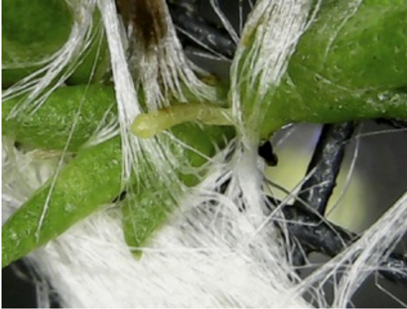
An initial root of a seedling Tillandsia.

all directions. Eventually some end up attaching to what they are mounted on, or, at least, most do. Why would germinating seeds be different?