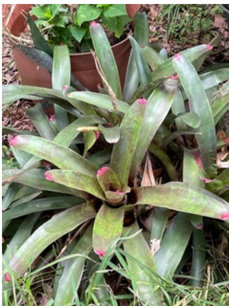
The commonly seen N. spectabilis x marmorata .