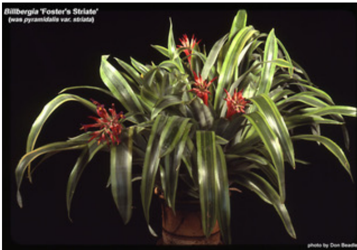
Originally called Billbergia pyramidalis v. striata, but now registered as B. 'Foster's Striate'.